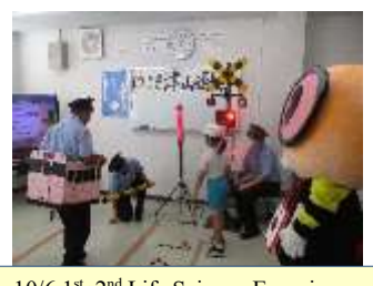
10/6 1st • 2nd Life Science Experience