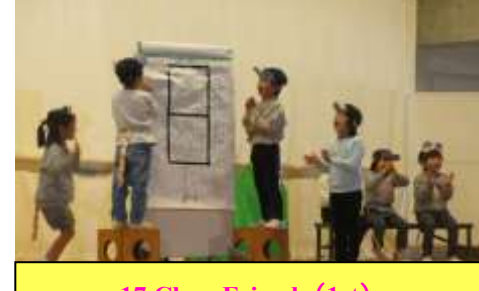
17 Close Friends (1st)