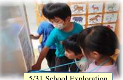
5/31 School Exploration