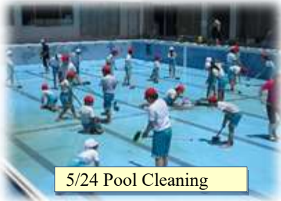
5/24 Pool Cleaning