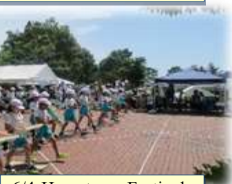
6/4 Hometown Festival