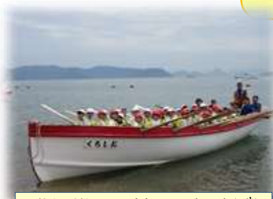
5/31 • 6/1 Maritime School (5 th )